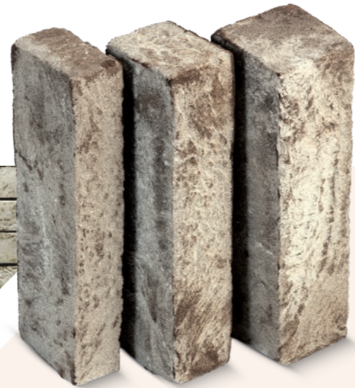
N70/4 N70/5 N70/6,5